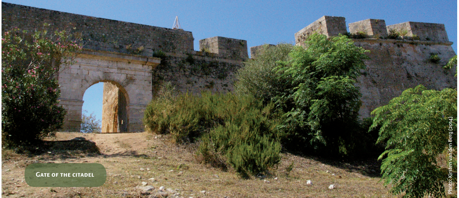
GATE OF THE CITADEL