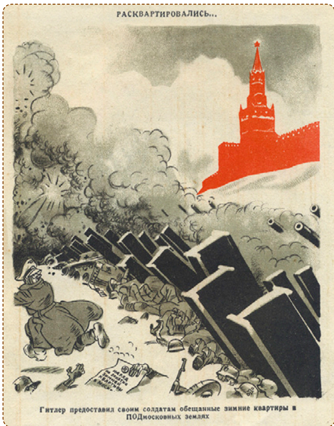
13 Title: Quartered ... Caption: Hitler makes winter apartments available NEAR Moscow, which he promised to his soldiers